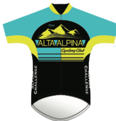
Fashion Kit: Order from inventory. https://www.altaalpina.org/clubkit/