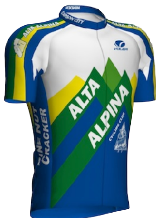
Yellow and Blue: Order from inventory. https://www.altaalpina.org/clubkit/