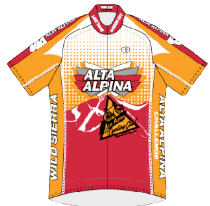
Red and Orange: Order from inventory. https://www.altaalpina.org/clubkit/