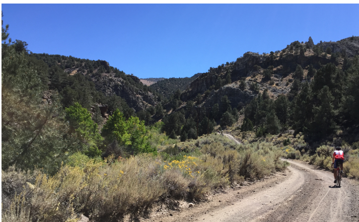
Mixed Terrain to Bodie: The Canyon