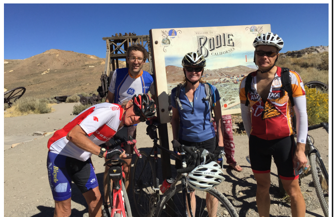
Mixed Terrain to Bodie: Stopping at Bodie