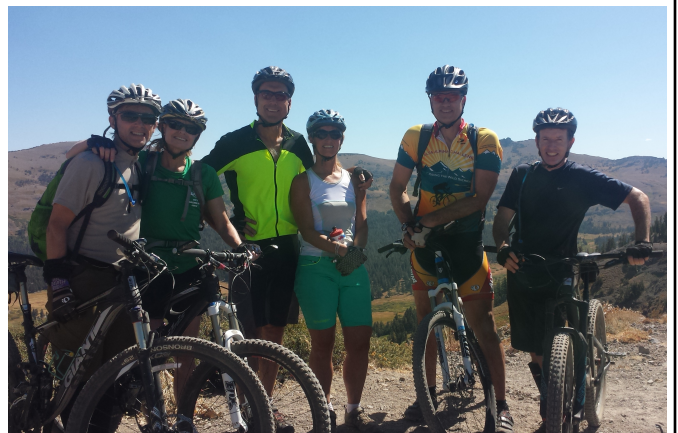
MTB Epic Ride: Little Round Top