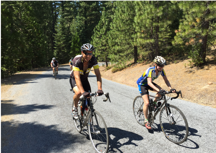
Mormon Emigrant Loop