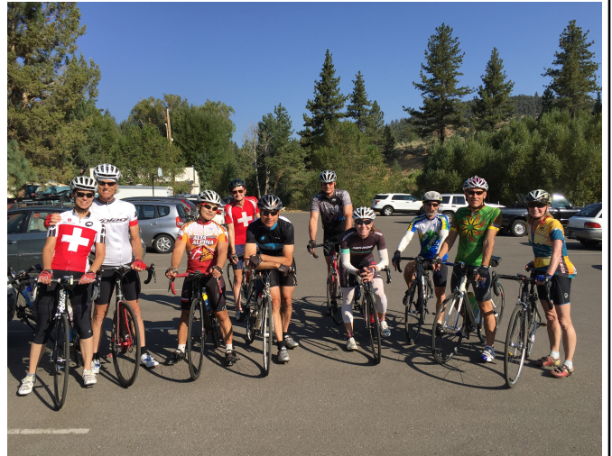
Markleeville to Lake Alpine