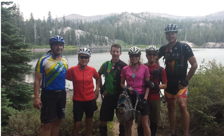
MTB Epic Ride: Round Lake