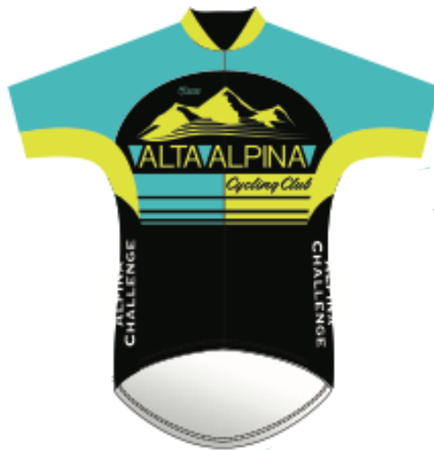
Fashion Kit: Order from inventory. https://www.altaalpina.org/clubkit/