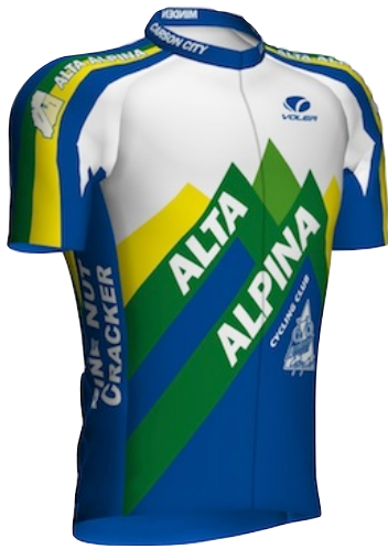
Yellow and Blue: Order from inventory. https://www.altaalpina.org/clubkit/