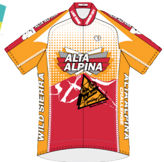
Red and Orange: Order from inventory. https://www.altaalpina.org/clubkit/