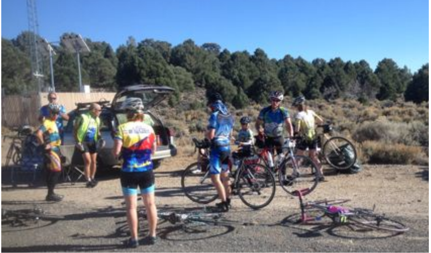
Socializing at the Sweetwater Rest Stop.