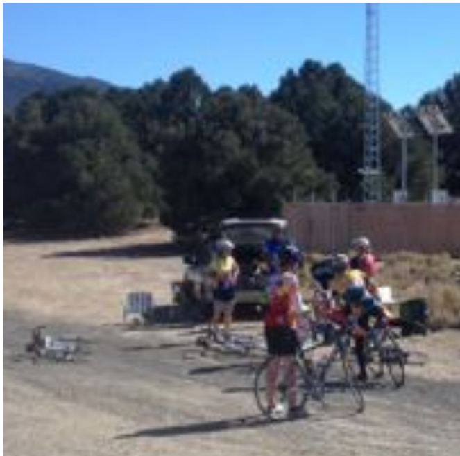
Dave organized the Sweetwater pass rest stop.