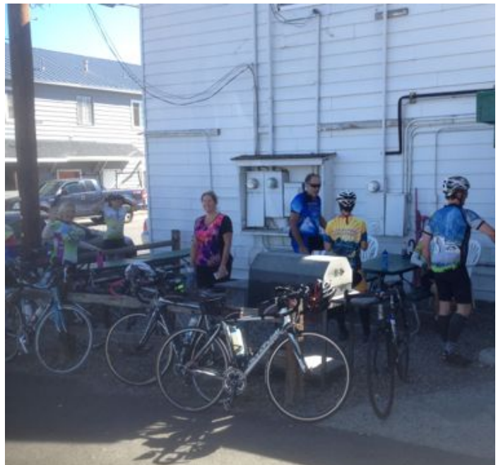
Riders at the turn-around in Bridgeport.