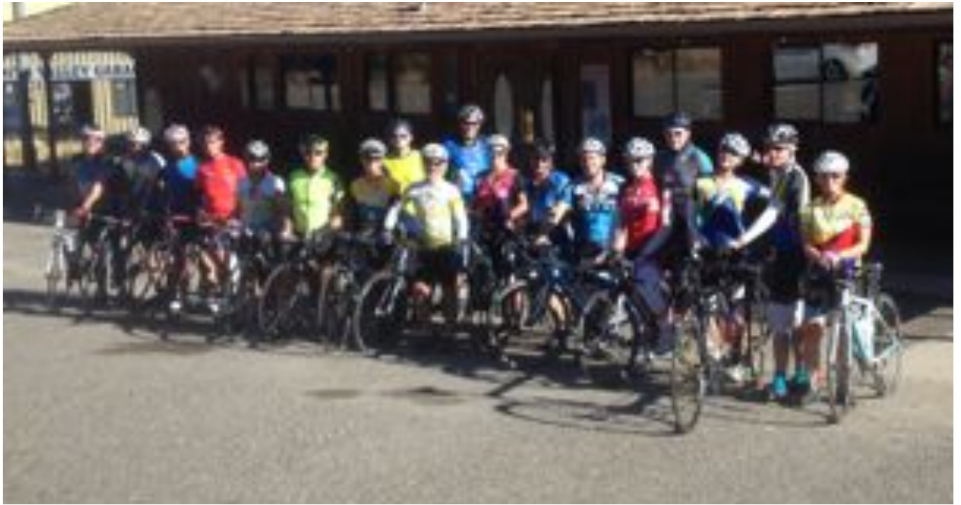
Club Members assemble to enjoy a day of perfect weather on Sweetwater Pass.