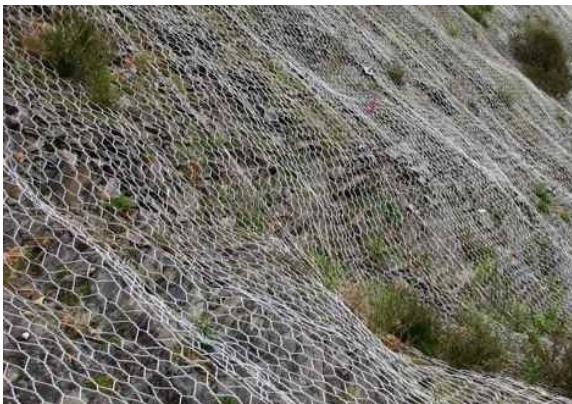
Temporary fencing being installed now