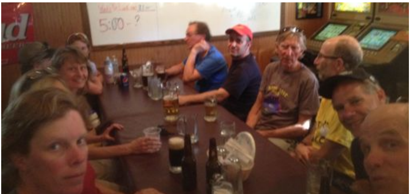
The group celebrates in Wellington with pizza and beer.