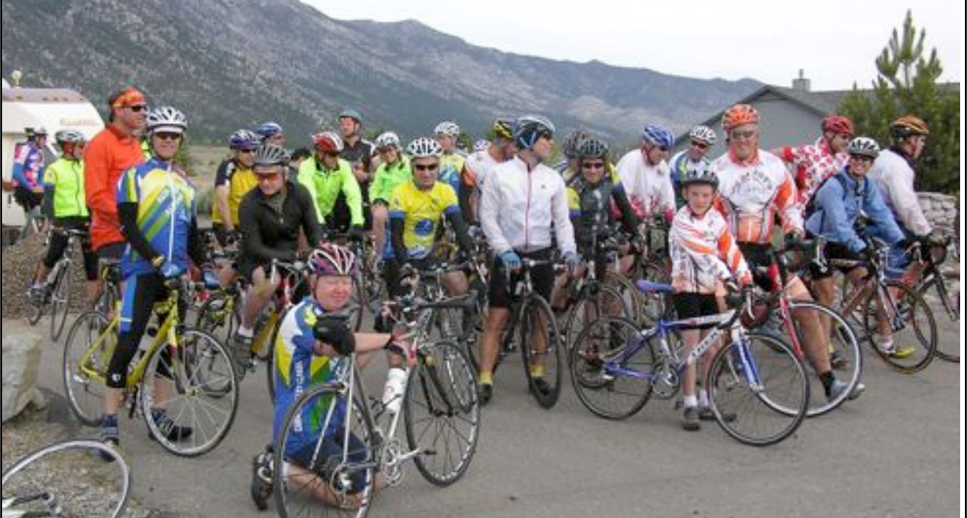
Club members pause for a group picture before rolling out on a perfect riding day.