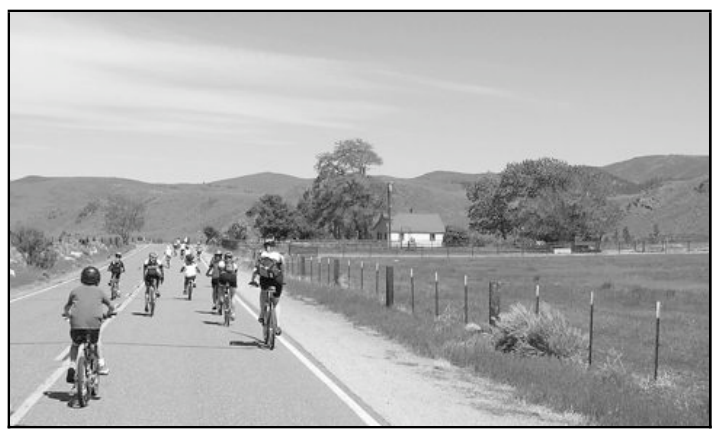
It was a mass start, as kids and their adult escorts started the descent from Diamond Valley School.