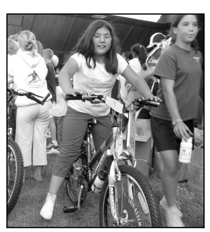
The most exciting part of the event was the raffle for 11 brand new bikes!