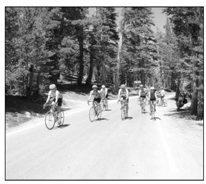
Using the Ride Board