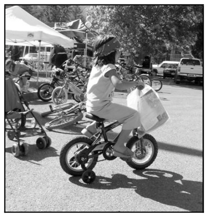
The Bike-A-Thon winds down as another raffle winner pedals away on her prize.