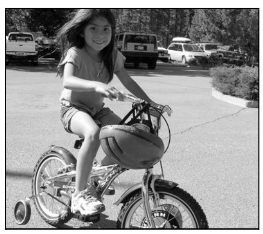
A big smile from one of the raffle winners.