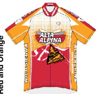
Red and Orange