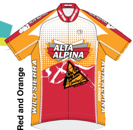
Red and Orange