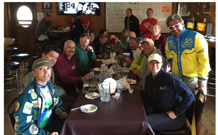
Tim Rowe Memorial Fall Century