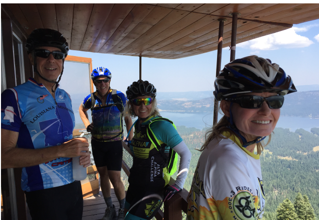
Davis Lake Camping Weekend