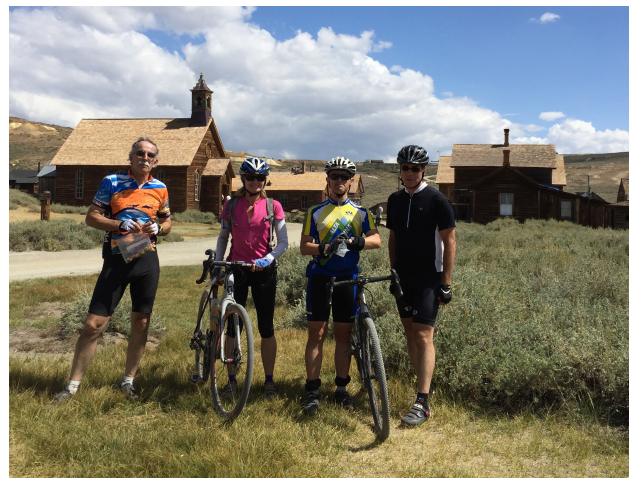
Bodie The Hard Way Ride