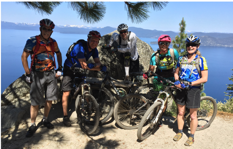
Flume Trail Ride