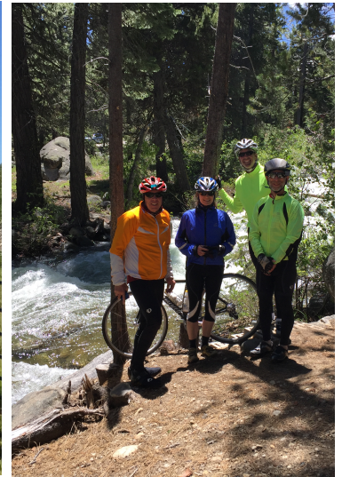
Blue Lakes Ride