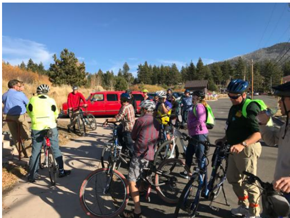
Conference Participants take a guided tour by bicycle