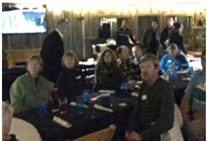
The venue was nicely decorated, organized, and cozy