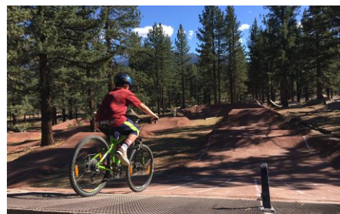
Start of the BMX track