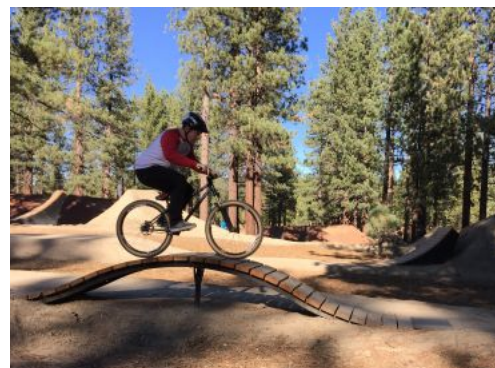
This roller looks WAY steeper from the rider's point of view