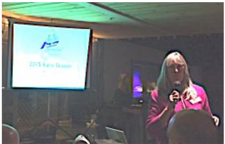
Di hands out trophies for the 2015 race season