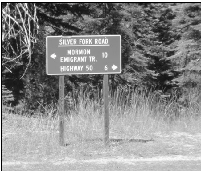
A Silver Fork in the road, out in the middle of nowhere

We enjoyed some of the most scenic and intriguing cycling roads our area has to offer, producing comments like "How did you ever find this place?" (Val), and "This road gets the Alta Alpina stamp of approval!" (Jennie). The Packsaddle Pass road and subsequent connectors took us from Highway 50 at Strawberry, south through the forest and over the ridges to Highway 88, west of Silver Lake. There were mountain vistas and stands of pine and fir for our viewing pleasure, moderate gradients to climb and descend, and, get this, virtually no traffic. Nice! The thorns on the way to the fruit came in the form of the busy California highways we had to traverse to get to the good parts. Argh! None the less, all sixteen intrepid Alta Alpinas and guests managed to survive the traffic gauntlet, and at the end of the day there were smiles on those salt encrusted visages. It was another fine day on the road with Alta Alpina.