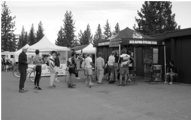
5 pass rider check-in