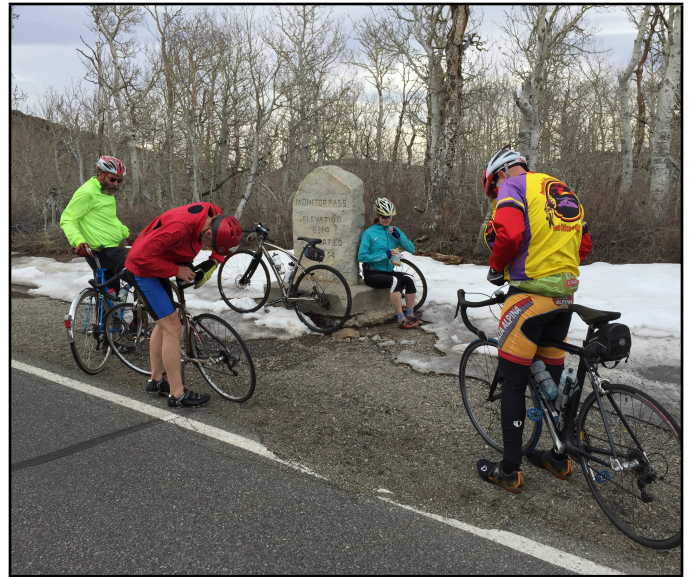
Weekend ride to the top of Monitor on March 15