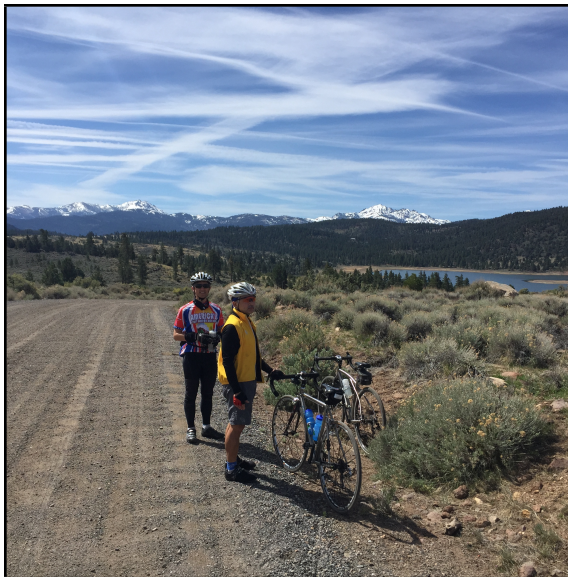
Rick's Hairy Roubaix Ride