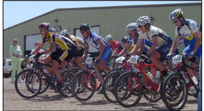
Start of the Pinenut Cracker

The club member entry fee is $15 for adults and free for juniors. If you prefer lounging in the sun over racing, we still need volunteers for registration, course marshaling and neutral feed.